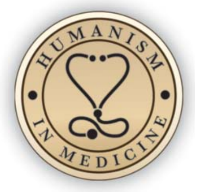
Arnold Gold Faculty Humanism Award