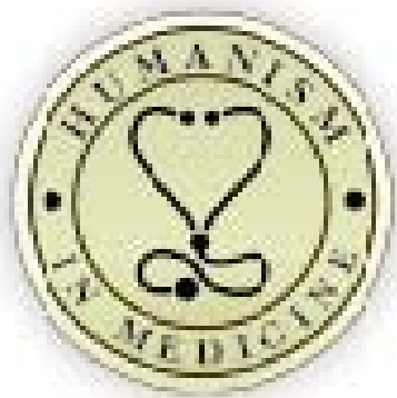
Arnold Gold Faculty Humanism Award