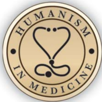
Arnold Gold Faculty Humanism Award