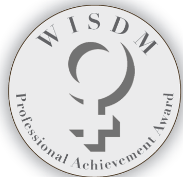
WISDM Professional Achievement Award

Kontos MSB Auditorium Wednesday, September 21, 2016