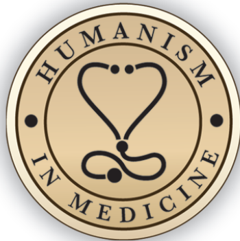
Arnold Gold Faculty Humanism Award