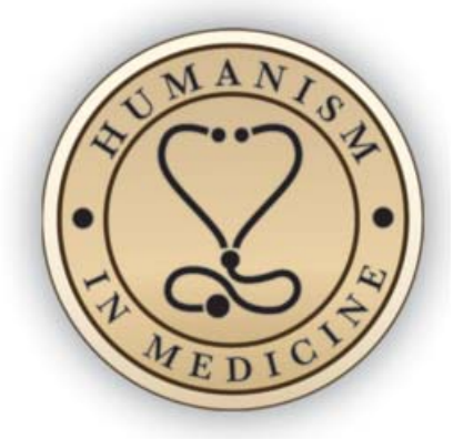
Arnold Gold Faculty Humanism Award