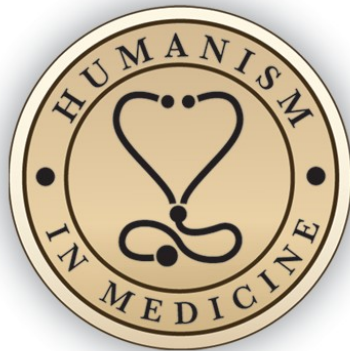
Arnold Gold Faculty Humanism Award