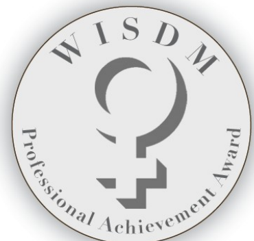
WISDM Professional Achievement Award

Kontos MSB Auditorium Wednesday, September 25, 2019