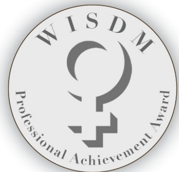
WISDM Professional Achievement Award