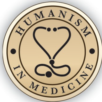
Arnold Gold Faculty Humanism Award