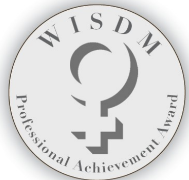
WISDM Professional Achievement Award

MMEC Learning Theater Tuesday, September 20, 2022