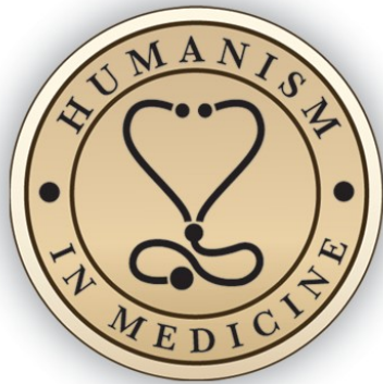
Arnold Gold Faculty Humanism Award